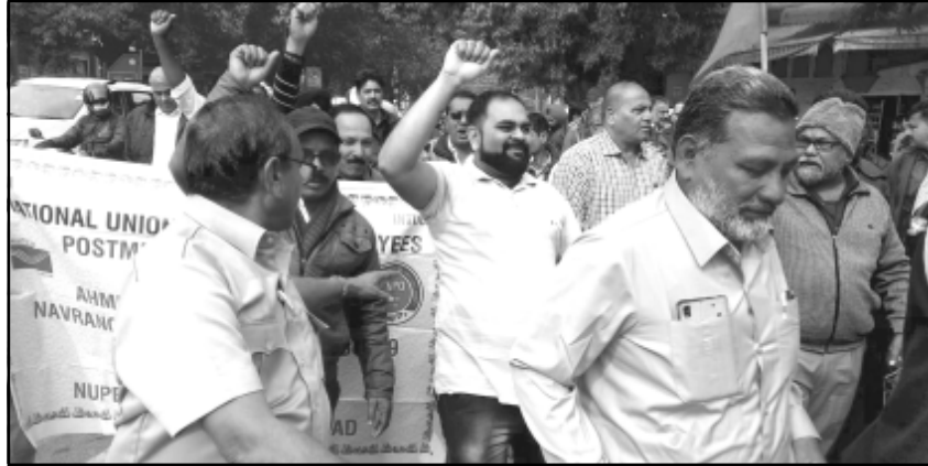
NUPE P-IV Postal Union employees showing their solidarity with Agitation Programme at Dak Bhawan