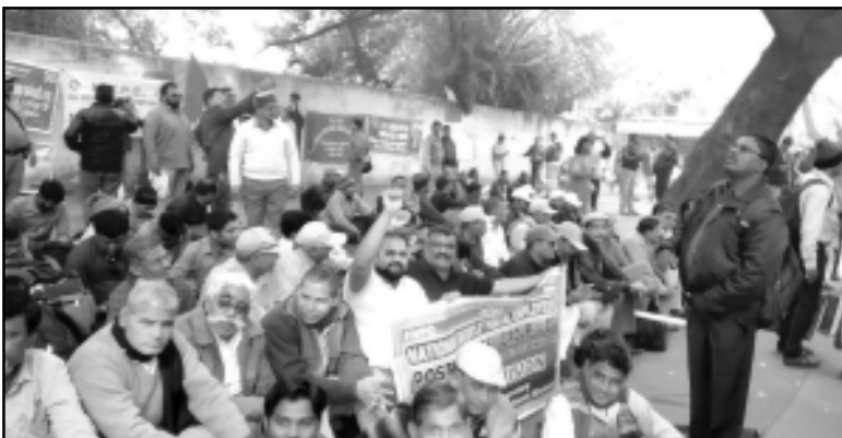
Postmen and other Members of JCA raising their voice in front of Dak Bhawan, New Delhi