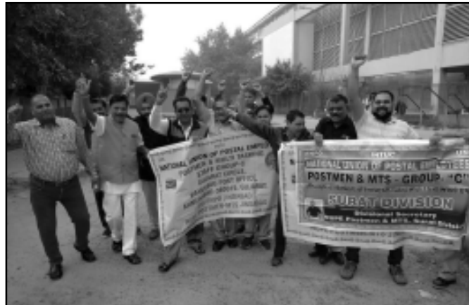
Member of NUPE Postmen and MTS, Gr C marching in front of Dak Bhawan, New Delhi